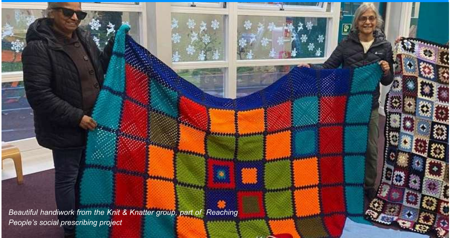
Beautiful handiwork from the Knit & Knatter group, part of Reaching People's social prescribing project