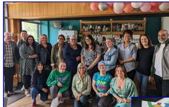
Participants at The Emerald Centre: benefitting from building connections