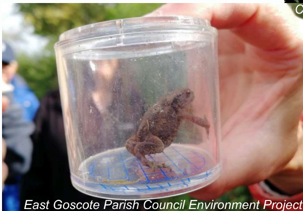
East Goscote Parish Council Environment Project