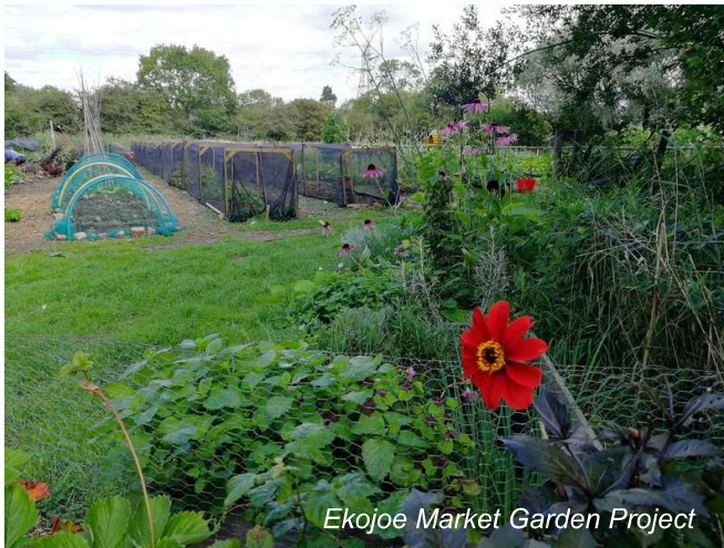
Ekojoe Market Garden Project

Small projects Big impact 24 organisations across Leicester, Leicestershire & Rutland delivered a wide range of environmentally focussed projects with their communities