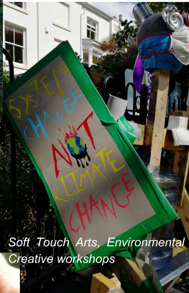
Soft Touch Arts, Environmental Creative workshops

Not only did the projects benefit local natural and urban environments, but they also showed how engaging in nature can produce great outcomes for people's health - both physical and mental!