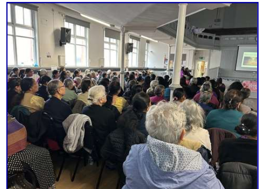
A packed house at the Belgrave International Women's Day event, supported by the Reaching People social prescribing lead.